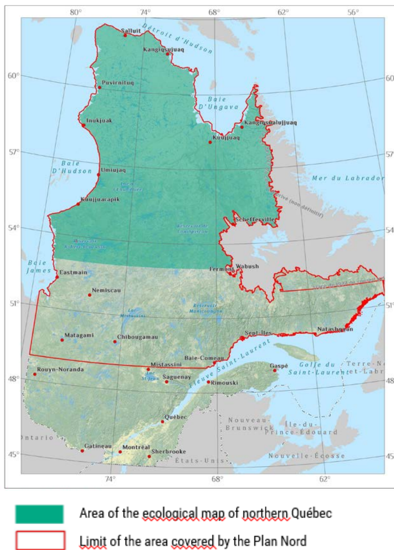
Figure 1 Territory of the ecological map of northern Québec

The major economic, social and environmental development project of the Québec government for the area north of the 49th parallel, known as the Plan Nord, requires the provision of systematic knowledge of this vast territory (Figure 1). To this end, ecological mapping of the vegetation of northern Québec partially meets this need, by providing information on the terrestrial ecosystems, both forest and non-forest. This ecological mapping is based on the application of rigorous criteria for stratification of vegetation and the physical environment. These criteria are presented in this standard. The ecological mapping territory covers 682,000 km 2 north of the 53 rd parallel (Figure 1).